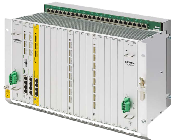
SICAM AK 3 (design: 17-slot rack)

Automation devices in critical infrastructure applications have to meet stringent and continuously evolving requirements with regard to cybersecurity.