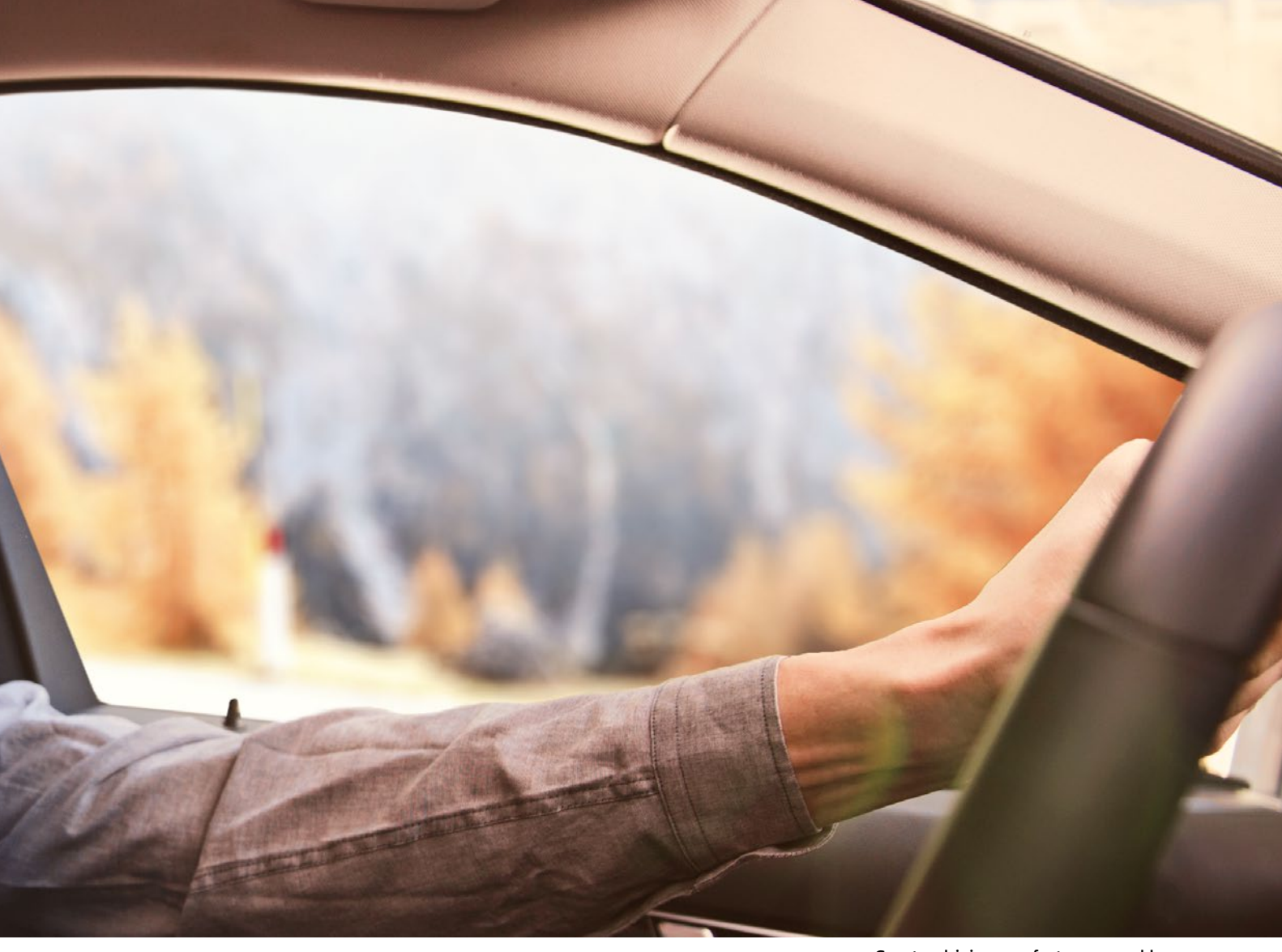
Greater driving comfort – ensured by the ultramodern dynamometer from AZL equipped with Siemens components

or most car buyers – sports car fans aside – a quiet and smooth driving experience is an expected characteristic of a new car. This inconspicuousness not only translates into greater driving comfort, it also represents quality in manufacture. This requirement poses a challenge for automobile manufacturers. Fortunately, specialized companies such as Akustikzentrum Lenting (AZL) provide the necessary expertise, the technical equipment, and effective processes to detect unwanted noise and vibration and their causes already during the development of new vehicle models.