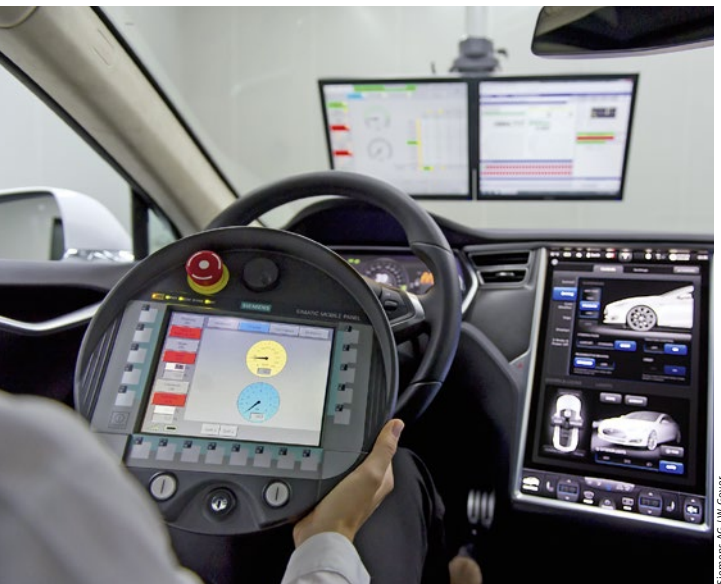
Test situation inside the vehicle to be tested, with a Simatic Mobile Panel

Sinamics converter switches between motor operation and generator operation with absolutely no shock or delay. Because of the motion control technology and control functions integrated directly into the drive, the overall system reacts especially quickly. Simotion controls the four axes and the various operation modes. The auxiliary equipment and the safety program run via the ET 200S distributed I/O system.