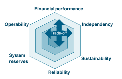
Figure 1: Conflict of objectives within industrial supply systems

The combination of distributed energy sources, electrical storage and/or diesel generators can enable a more efficient energy supply and operation of the installed generation and lead to a reduction in the required diesel capacity. As there are often contradictory factors which influence the decision, there are no ready-made solutions to define planning criteria and the individual trade-off has to be developed (see figure 1). Therefore the experience of the grid planner is very important to reach the desired results.