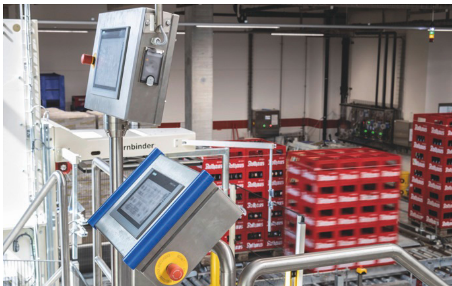
SIMATIC HMI Panels integrated into the production network make the processes locally transparent and easy to operate.

The subordinate Gigabit ring segments are redundantly connected to the backbone via layer 2 switches of the SCALANCE X-300 and X-200 series – depending on the scope and required functionality. Here, as well, proven redundancy mechanisms reliably maintain the communication in the event of a network device failure. To protect against unauthorized access to cells in the process control system network, high-performance SCALANCE SC636-2C Industrial Security Appliances have been specified and in some cases are already in use. “Because we exactly know the processes, these cell firewalls can be easily retrofitted at any time,” states Michael Dufner, IT engineer at HWI IT responsible for the project.