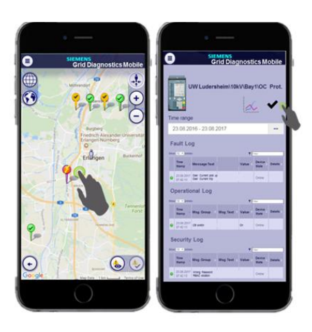
Figure 3: Example for a field device monitoring application

It was only a question of time until IoT technologies entered the energy sector. Although they may be new to this field, the first solutions prove that the technology makes a positive contribution. Data which were unused before can now be utilized and deployed to increase profits by optimizing processes. So-called IoT platforms ensure that assets can be quickly linked with each other, regardless of their manufacturer, and guarantee the smart processing of the derived information. Tailored applications visualize the assets for the user. This opens up