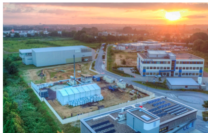
Figure 1: Distributed energy system

increasing share of decentralized and smaller units, more and more energy is generated and consumed locally towards areas that are supplied in so called Decentralized Energy Systems (DES) and microgrids. These systems can be operated autonomously and/or in islanded mode, but also as part of a larger grid.