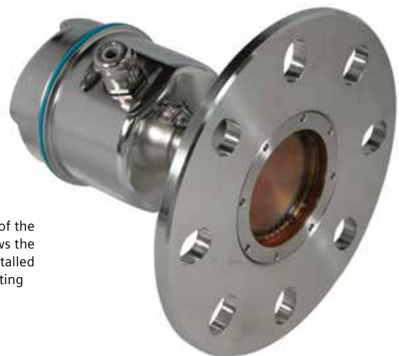
Flush mount flange of the SITRANS LR560 allows the transmitter to be installed directly onto an existing standpipe.

Fortunately, the plant engineers knew what to do. They knew that Siemens was a global leader in level measure-