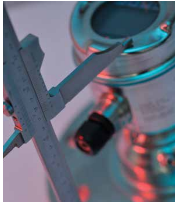
The small size of the SITRANS LR560 makes it easy to carry and install.