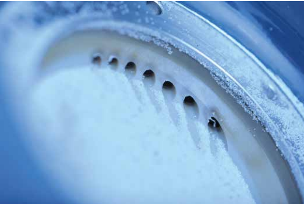
Sticky sugar won't interfere with readings due to SITRANS LR560 innovative sealed lens antenna design.