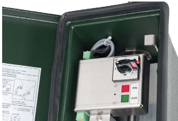
Integration into control of operated mechanism with permanent power supply

In the case of manually or motor operated disconnectors, the signal is processed in an external evaluation unit and is forwarded with floating contacts to SCADA.