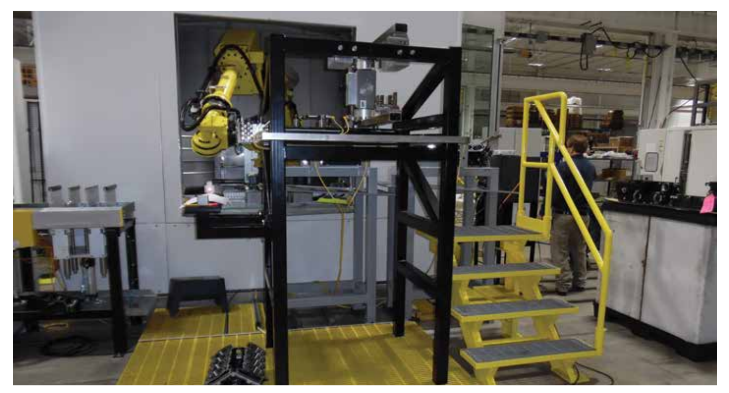
Durr EcoClean Eco Flex Robotic Washer