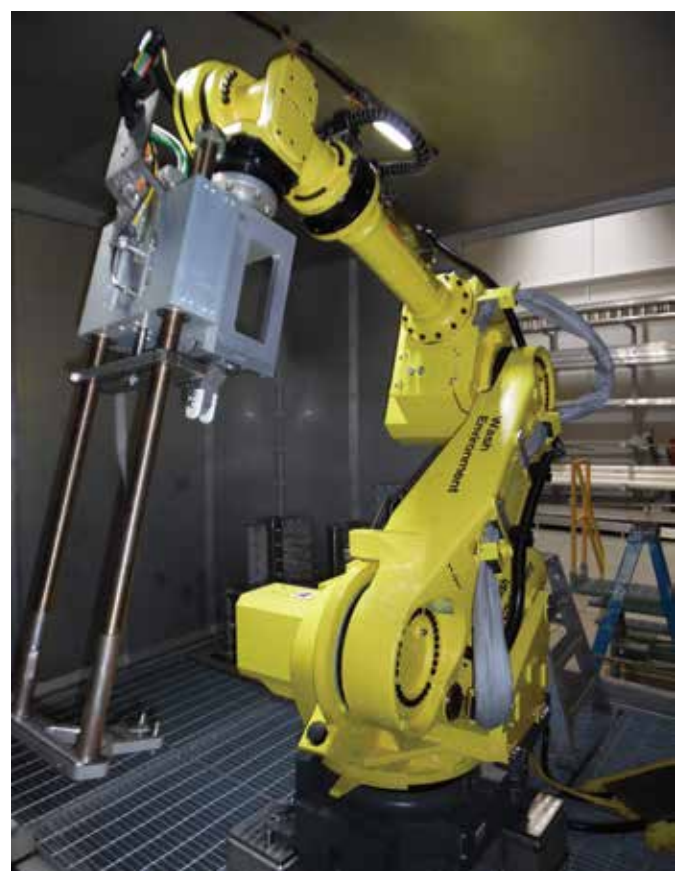
Robot inside of washer enclosure

Brumar points out the value that the added visibility provides: "By knowing some heaters have failed or are failing because their drawn amps are dropping, operators can then choose to nurse it along until a time when production is slack and doing maintenance and repair won't impact the production line. That can save the plant a small fortune in lost output."