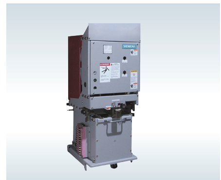
Siemens HVR (replacement for ITE HV)