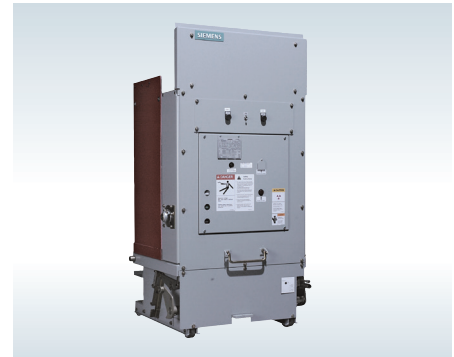
Siemens HKR (replacement for ITE HK)