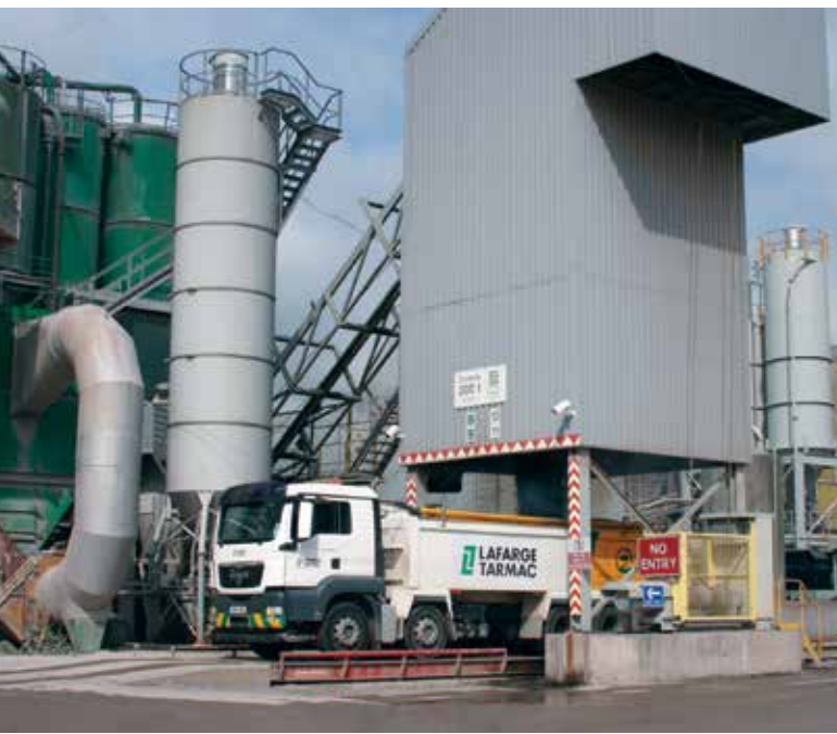
Trucks arrive daily to pick up hot asphalt from Lafarge Tarmac's finished asphalt storage silo. The SITRANS LR560 radar transmitter is installed at the top of the 10m narrow silo that houses the fibre.