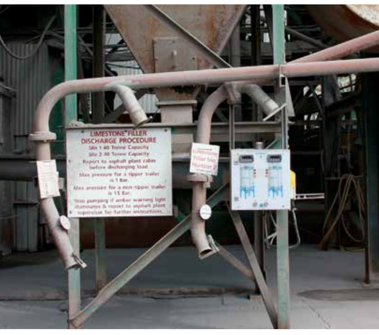
Delivery truck drivers can easily read the display panel while filling limestone dust into the two storage vessels.

For the past century, the Bayston Hill site near Shrewsbury has produced high-quality materials used locally and across the country on major road projects.