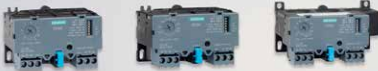
Solid-State ESP200 Overload Relay Class 48

To Protect and Serve, Defending Your Investments