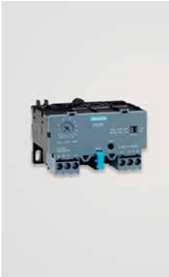
Solid State ESP200 Overload Relay Class 958L