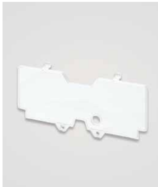
Tamper Resistant Cover