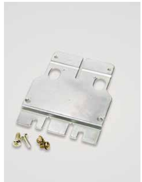
Mounting plate for the ESP200 to be coupled with the contactor plate