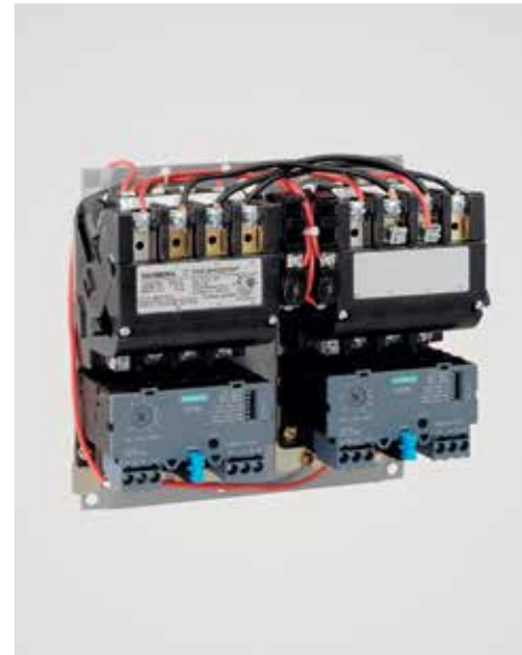
Two-Speed Reversing Starter with ESP200 Solid-State Overload Relay – Class 30

This versatile line offers a motor starter for every application you may have. Siemens offers full or reduced voltage NEMA starters with solid-state electronic or bimetal overload protection, single-speed or two-speed, reversing or non-reversing, single-phase or three-phase, in full and half sizes 00-8. From fractional horsepower to large 900 HP motors, Siemens NEMA starters are the right choice for demanding applications. All starters are UL listed and CSA certified.