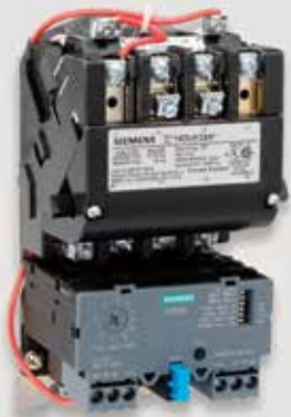
Non-Reversing Starter with ESP200 Solid-State Overload Relay – Class 14

A versatile line of starters and industrial applications