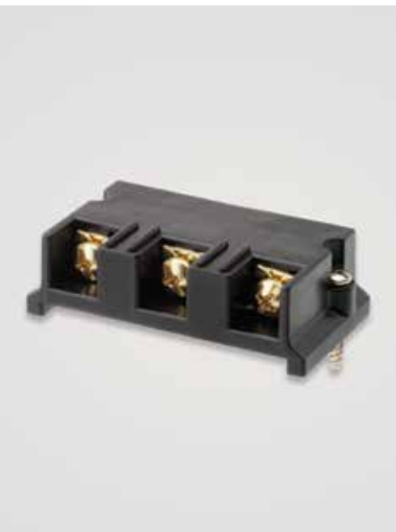
Terminal kit for use with direct coupled overload relays to separately mount.