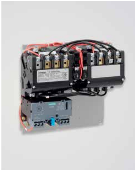
Reversing Starter with ESP200 Solid-State Overload Relay – Class 22