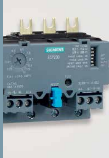
Solid State ESP200 Overload Relay Class 958

Building and improving on past successes, self-powered ESP200 overload relays are a revolution for both industrial and construction applications. These overload relays provide accuracy unmatched in the market. With repeat accuracy of greater than 99%, trips can be set to the most specific conditions, resulting in both longer motor life and cost savings.