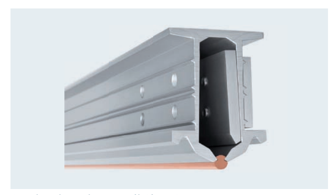
Overhead conductor rail Sicat SR

The switchgear / diode cabinet is based on components of the compact switchgear Sitras CSG. Short circuit protection is guaranteed by Sitras PRO devices inside the LCU-container. The configuration control is realized by the station control system Sitras SCS in the traction substations. Touch voltage protection is handled by the compact short-circuiting device Sitras SCD-C. All equipment is mounted in prefabricated containers. A project dependant integration into customer's rooms is possible. The overhead conductor rails Sicat SR consist of aluminum with copper wire.