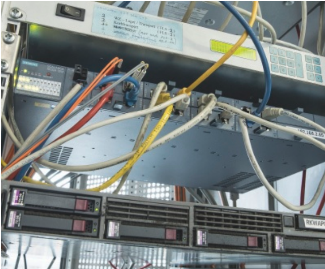
Nine fully modular managed Industrial Ethernet switches SCALANCE XR324-12M from Siemens form a high-performance and reliable backbone in the profile production.