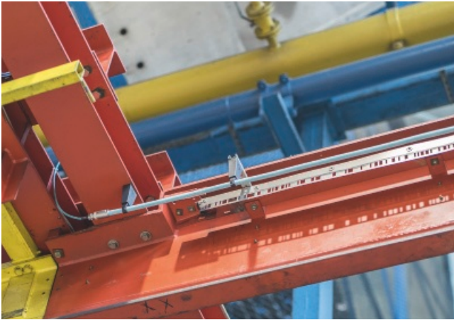
The RCoax cable from Siemens is a radiating antenna cable routed along the railway that ensures a WLAN field over the travel path.