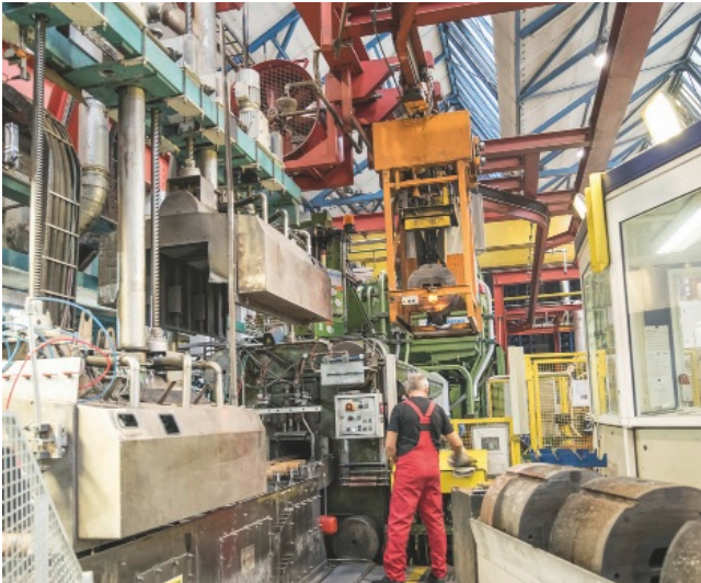
On two extrusion presses in the Rackwitz plant, Sapa Extrusion Deutschland produces high-grade aluminum profiles for a wide range of applications, and refines and postprocesses them.

Within the framework of the CE certification of its products, Sapa reviewed certain production conditions in the plant. In the process, a so-called security quick check was performed together with consultants from Siemens, Sapa's long-time supplier for electrical and automation technology. In general, the availability of the entire network was to be examined to assess the risks of system failures, e.g., caused by cyber-attacks, and their impact on production systems. The security analysis then revealed that the industrial suitability of individual network components as well as the access protection to switches, PCs, controllers, and communication processors in the field could be optimized. The same applies to the failsafe communication during the operation of the three trolleys for the transport of press tools and scrap. As a result, specific measures were derived and practical solutions developed together with the supplier – some of which are already implemented.