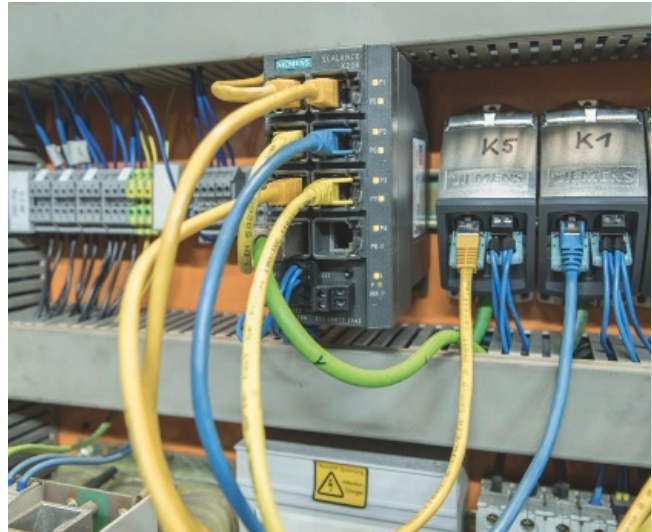
A number of network devices are connected to the backbone via subordinated managed switches of the type SCALANCE X-200 in control cabinets.

Some of the currently approximately 200 relevant participants in the field are connected to the backbone directly and some via subordinated managed Industrial Ethernet switches SCALANCE X-200 in decentralized control cabinets. As a result, a horizontally and vertically integrated, rugged, and reliable communication can be ensured production-wide.