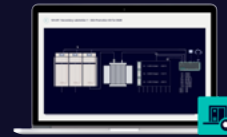
Electrification X – Distribution Grid Monitoring