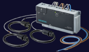
SICAM EGS enhanced grid sensor (gateway)