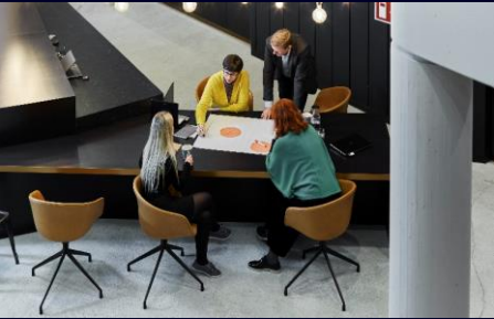
Siemens Real Estate