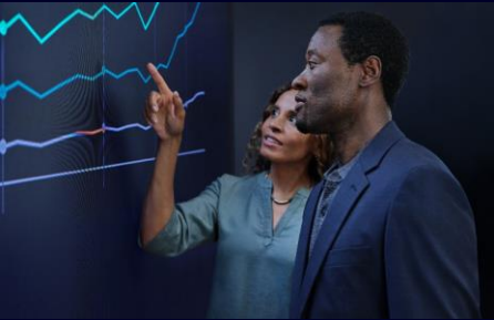
Siemens Financial Services