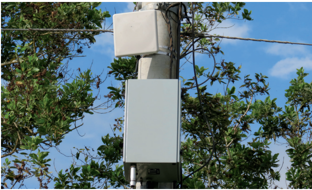
RUGGEDCOM WIN wireless subscriber units are specifically designed for point-to-multipoint broadband wireless access applications

At some time in the future, we're going to have to install equipment in individual houses."