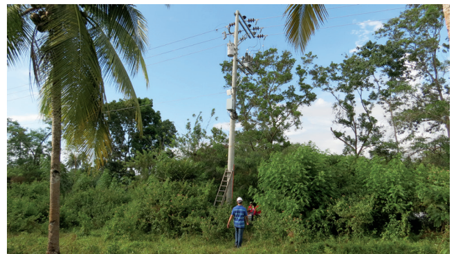
RUGGEDCOM WIN delivers the benefits of carrier-grade 4G technology to critical infrastructure applications in harsh environments

Due to both urban and rural geographic factors, as well as difficult climatic conditions, CEPALCO realized there are limitations to its terrestrial network, especially in terms of last-mile connectivity with customers. There is a lot of widespread terrain to deal with that is not logistically suitable or economically feasible for fiber-optic cable. That includes rugged mountains and heavy vegetation in the rural regions of Mindanao, as well as dense urban environments with many large buildings in close proximity to one another.