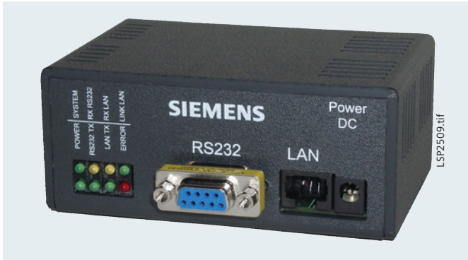
Fig. 13/86 7XV5850 Ethernet modem