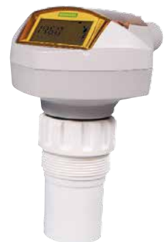
SITRANS Probe LU is the level transmitter of choice at Agnico Eagle Mines to measure level in turbulent conditions.

The mill operators were frustrated with the performance of Agnico Eagle's standard level transmitters—a