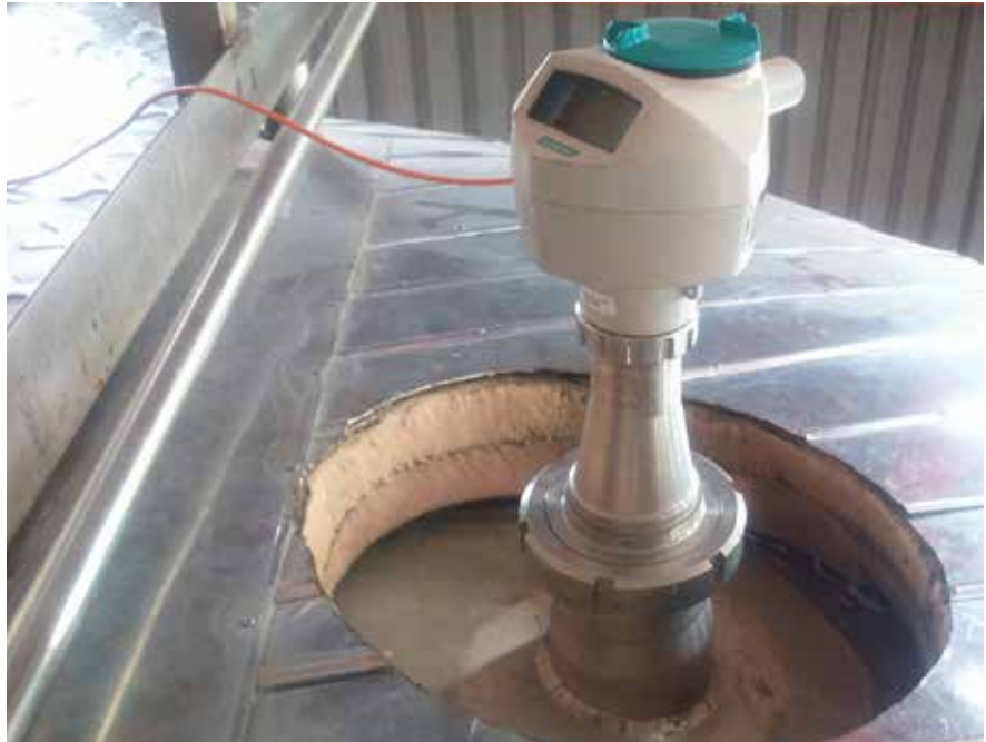
SITRANS LR250 measures accurately, even through foam conditions at SAB Miller.