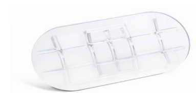
Asset Tag Mounting Bracket