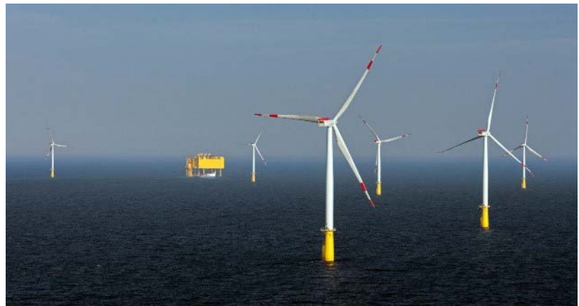
Digital Service for offshore grid access