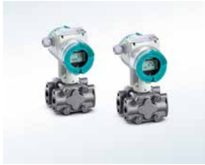
Sitran pressure transmitters

A major chemical company was looking for a new solution for their vent gas applications in their Flameless Thermal Oxidizer (FTO) system. The system is divided between wet gas vents and dry gas vents; a main header for each side channels flow from knockout pots to one of two reactors via branching pipelines. The complete system included 6 measurement points (2 Headers and 4 branch lines) however EPA requirements mandated redundant measurement of the reactor feed lines bringing the total number of points to ten.