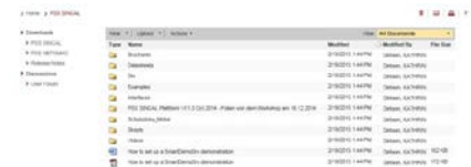
Figure 3: In the download area we offer a wide range of different materials and program files for download

information, such as brochures and videos, we offer program files including macros for Smart Grids or motors, as well as examples of Microsoft® Excel® imports.