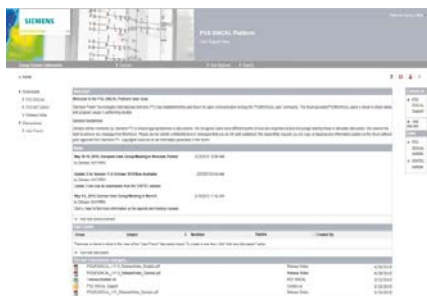
Figure 1: Overview of the PSS®SINCAL Platform User Area