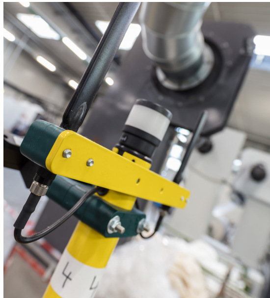
proANT transport robot with IWLAN antenna: the automated guided vehicle is designed for loads up to 200 kg and communicates wirelessly.

The company therefore heavily invests in digitalization and is constantly working on further automating its production. The result can already be seen today. For instance, only relatively few employees are directly involved in the production processes at the Borken plant. During the fully automated assembly, entire pillow and duvet covers are cut and sewn, and even the zippers are put in without human intervention. Bierbaum points out a decisive advantage that a production in Germany brings about. "In the Far East, there is not just a completely different awareness of quality than we are used to. A lot of work is also still done by hand, sometimes under problematic conditions," he explains. "What's more, the environment is treated quite carelessly. And no one can check with which colors the bed linens are printed or what kind of toxins are contained in the textiles." Bierbaum not only focuses on bed linens made from 100% cotton. The company also tests its products for harmful substances in accordance with the OEKO-TEX® Standard 100. And only European chemicals meeting German standards are used.