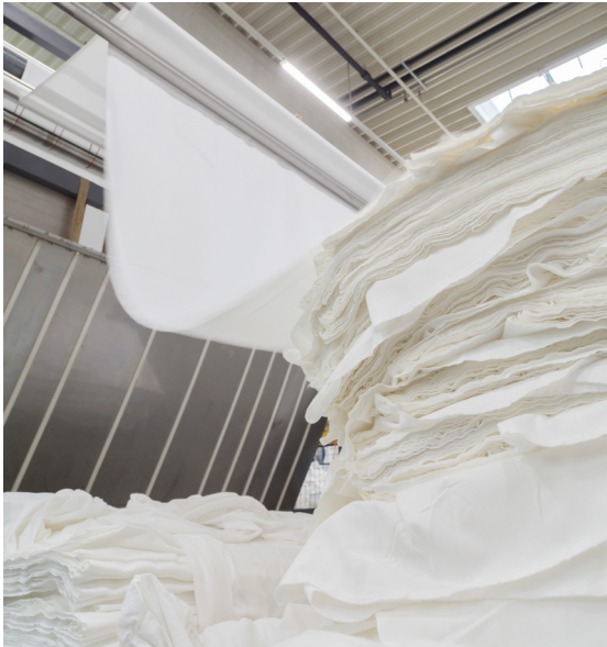
Textile printing: Bierbaum prints 25 million linear meters per year.