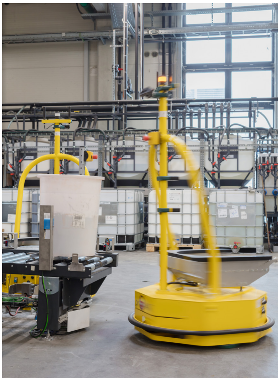
Docking process: the exact positioning of the automated guided vehicle at the transfer station is crucial in order for the proANT robot to automatically receive the paint buckets.

Bierbaum project manager Daniel Kock comments: “The four robots are actually only the beginning. We are convinced that there is great potential in this AGV solution. In the foreseeable future, all transport operations at the plant will be carried out through such systems”.