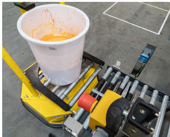
Your fellow robot at work: the color is on the way to the textile printing. The likewise automatically controlled roller conveyor accepts the load.