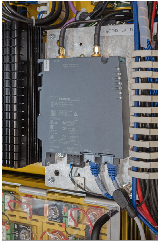
Compact SCALANCE W734-1 Client Modules inside of proANT