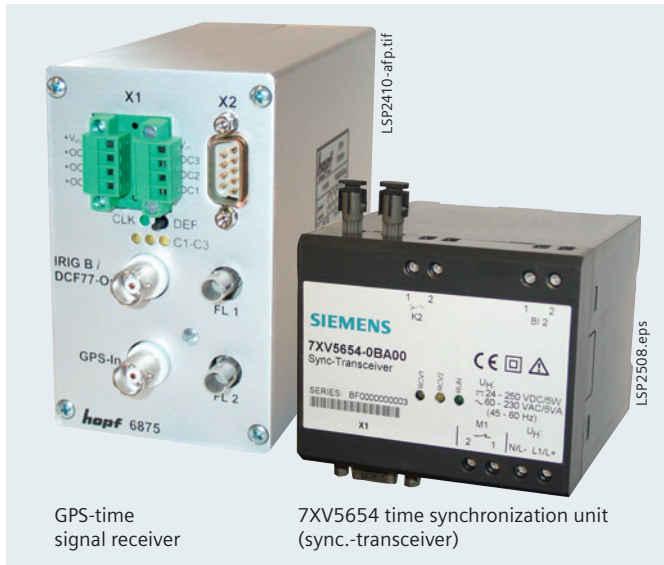
Fig. 13/124 GPS/DCF77 time synchronization system