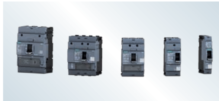
3VA1 molded case circuit breakers

Available as a switch disconnecter in a molded case circuit breaker design