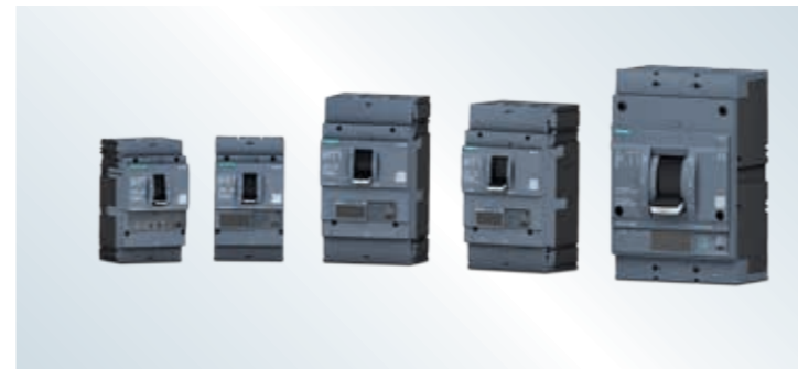
3VA2 molded case circuit breakers

Available in line, motor and starter protection versions