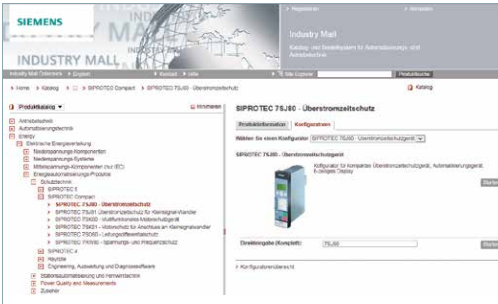
Energy automation products: online information, selection, and ordering.