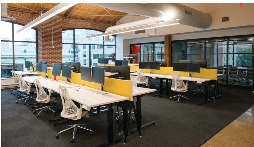
GSA research found that advanced LED lighting controls with daylight harvesting capability produced large energy savings, even in buildings with limited daylight.

Wireless operation is another benefit of advanced LED controls. Although GSA has cybersecurity requirements for wireless controls, the system installed in the Fort Worth building met