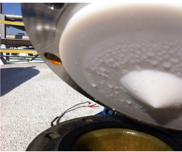
Droplets of chemical form over time on the transmitter's lens, but did not affect the SITRANS LR250's performance in any way.

density. Plus, it does not suffer from the reliability problems the company found with guided wave radar.