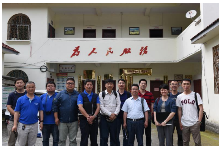
The first visit of EEO members to Guizhou Province for the “Traditional Village Electrical Safety Protection Project”