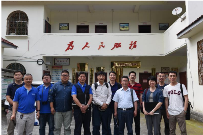
The first visit of EEO members to Guizhou Province for the “Traditional Village Electrical Safety Protection Project”