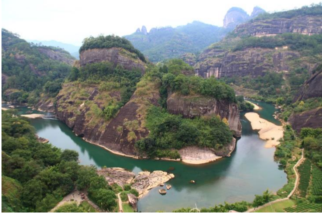
Hu Hongyu's photography work taken at Mount Wuyi.