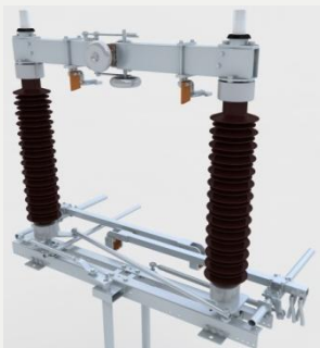
Double-side break 3DN2