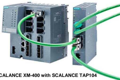
SCALANCE XM-400 with SCALANCE TAP104