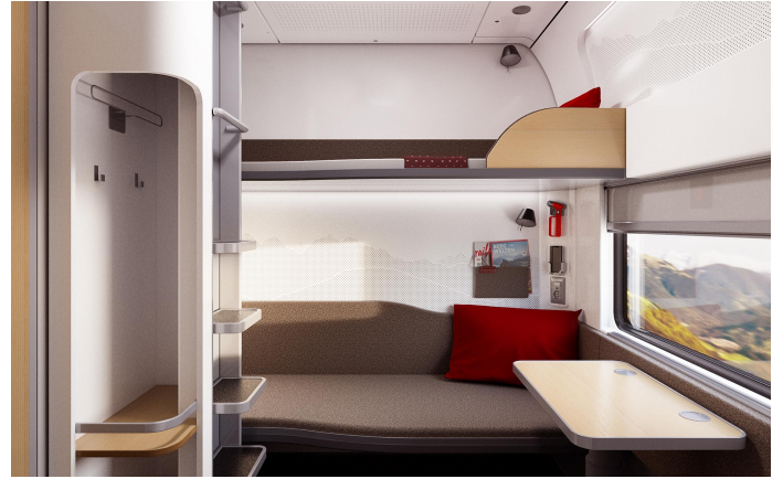
The new sleeper cabin design

The new generation of seven-carriage Nightjets have two seating carriages, three couchette carriages and two sleeper carriages. Here, too, ultra-modern design is combined with even greater comfort. In the couchette carriages, mini-suites offer even more privacy for solo travellers. In the sleeping carriages, travel will be even more comfortable, as the standard and deluxe compartments will in future have their own toilet and shower. Of course, the usual compartments will still be available but will be upgraded to the new design. New on board is the free WiFi service, which used to be restricted to long-distances journeys on the Railjets but will now also be available to passengers on board the new generation of Nightjets.