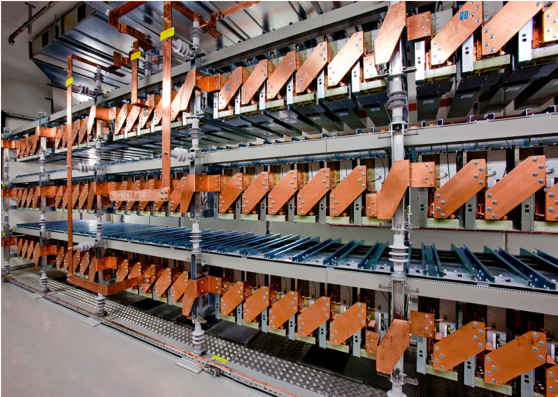
Modular multilevel direct converter

A branch consists of power modules connected in series with connected module capacitor. The number of power modules connected in series determines the power rating of the converter.