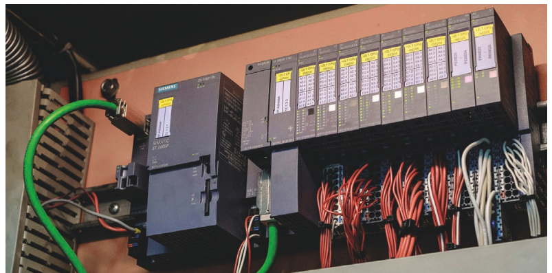
The compact dimensions of the SIMATIC ET 200SP allow a high channel density without taking up much space.

What ultimately swung the decision in favor of SIMATIC was the CP 1542SP-1 IRC module for the SIMATIC ET 200SP system, which, among other things, supports the standardized IEC 60870-5-104 telecontrol protocol. This IEC protocol is used in numerous European water treatment plants and is therefore regarded as an industry standard. The CP 1542SP-1 IRC communications processor can be commissioned quickly by means of easy and convenient engineering in the TIA Portal, the engineering framework for the integration of automation components. The cyclic or event-controlled transfer of data enabled the telecontrol communication to be matched optimally to the process.