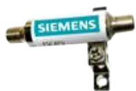
FSCATV Incoming cable TV or satellite service Surge Protection