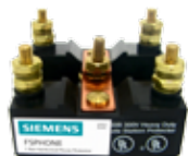
FSPHONE Incoming Telephone/DSL service Surge Protection