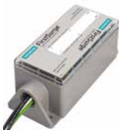
FirstSurge™ Power, Plus or Pro Power Surge Protection for all electrical and electronics inside the home