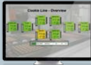
Important information at a glance at all times