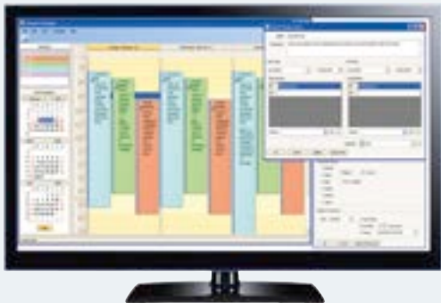
WinCC/CalendarScheduler: Planning of calendar-based events