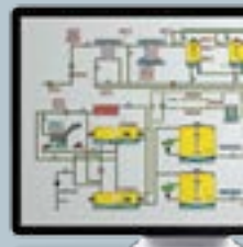
Efficient operations con