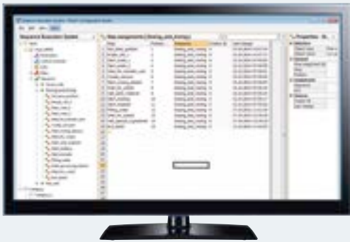
WinCC/SES: Efficiently process sequence-based recipes