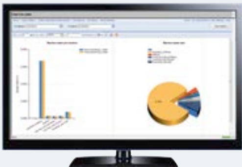
SIMATIC Information Server: Comfortable analysis and report generation