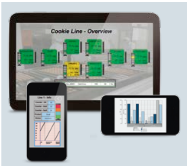
Safely informed with innovative solutions

In addition to the 24/7 hotline, you can for example also consult experts in forums and access freely available demo projects.