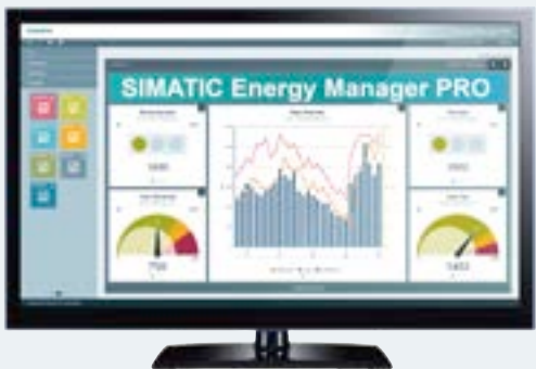
SIMATIC Energy Manager PRO: Increased production transparency