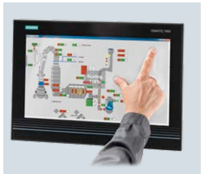
Easy and intuitive operation via multitouch gestures