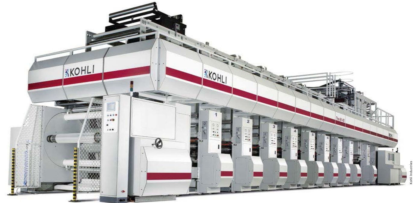
Scoring points with standardized automation and optimized printing technology: the new Thea rotogravure printing machine from Kohli Industries

The company's flagship Roboslit dual turret slitter can process plastic films and flexible paper and aluminum-based packaging materials with webs of up to 1,650 mm in width and a maximum speed of 800 m/min. The Roboslit can optionally be fitted with a servo-driven positioning system to ensure precise positioning of the cutters. This significantly increases productivity and reduces setup time to less than five minutes. The trim winding unit, fully integrated and synchronized with the machine, is a particularly interesting product for production. As well as supporting a cleaner and less noisy production environment, this technology simplifies waste removal.