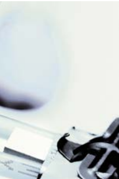
Batch review and release with SIMATIC IT eBR

SIMATIC IT eBR is based on the proven SIMATIC IT XFP solution, which has been used to improve the visibility and efficiency of entire operations at multiple plants worldwide.