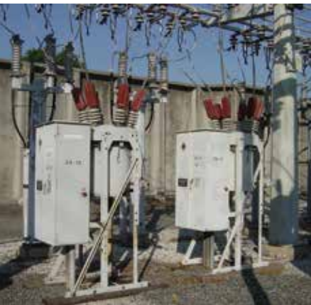
Siemens-Allis 30kV SDO circuit breaker