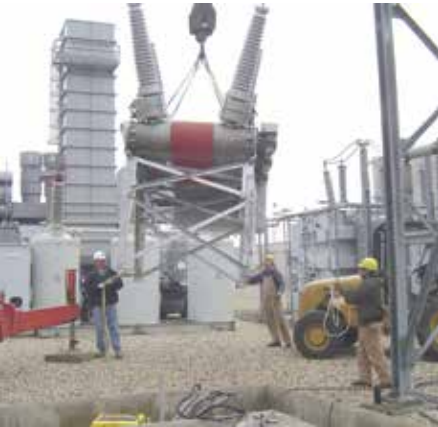
Turnkey breaker replacement with the new Siemens SPS2