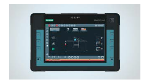
SIMOCRANE CMS provides operating and diagnostic information by means of a intuitive navigation interface.