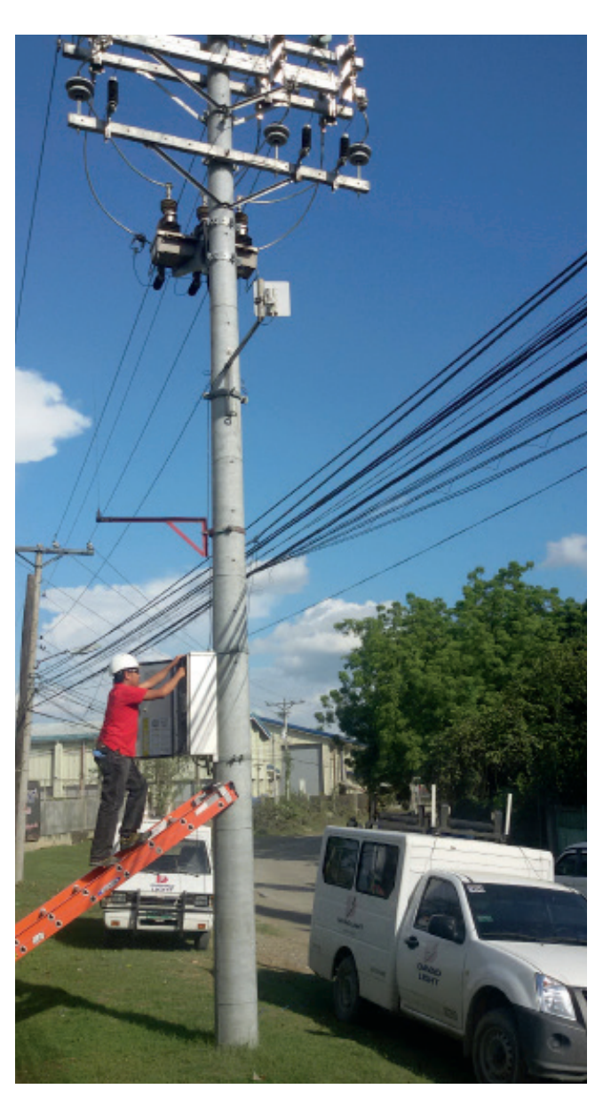
Demand response, remote disconnection

"That's an important feature and it's not available in the old equipment we had," he explains.