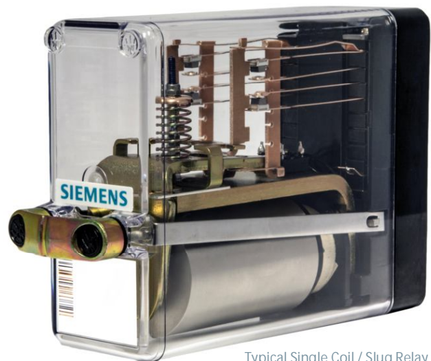
Typical Single Coil / Slug Relay