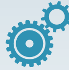
General machinery construction