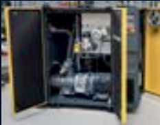
Kaeser Kompressoren SE