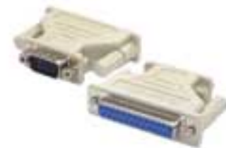
Adapter needed for 25 Pin cable