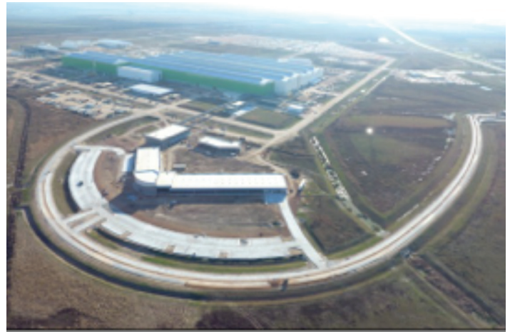
Tenaris BayCity seamless pipe plant sits on 1,500 acres and covers 1.2 million square feet. It is the world's largest automation implementation using the Siemens TIA Portal to program and manage nearly 50,000 IO points across 4,000 network nodes.

"While Tenaris is one of the world's largest suppliers to the energy industry, we're also 100 percent committed to conserving our use of energy," he says. "Beyond the cost savings, it's the right thing to do for our environment and our future. Given the plant's size and complexity, energy conservation was a big design challenge for us."