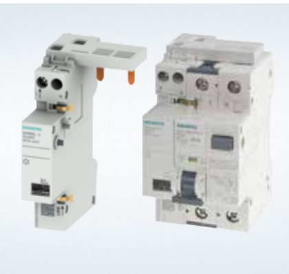
5SM6 AFD unit alone (left) and in combination with a 5SU1 RCBO (right)

Even the slightest faults in electrical installations can have serious consequences. About one-third of all building fires are caused by electricity, and approximately 30 percent of these fires can be traced back to defects in the electrical installation itself. The 5SM6 AFD unit offers a reliable means of preventing electrical fires by identifying the faults and safely disconnecting the circuit before the wires overheat.