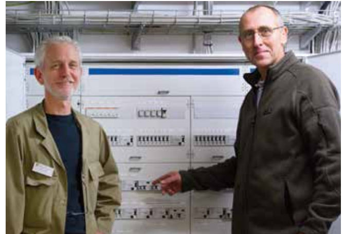
Ten AFD units from Siemens protect highly sensitive circuits in the Karolinen-Hospital Hsten against serial arcing faults.

“The AFD unit offers additional protection beyond conventional protection devices. If a fire is detected, the device identifies its cause, thus allowing the fault to be effectively corrected.”