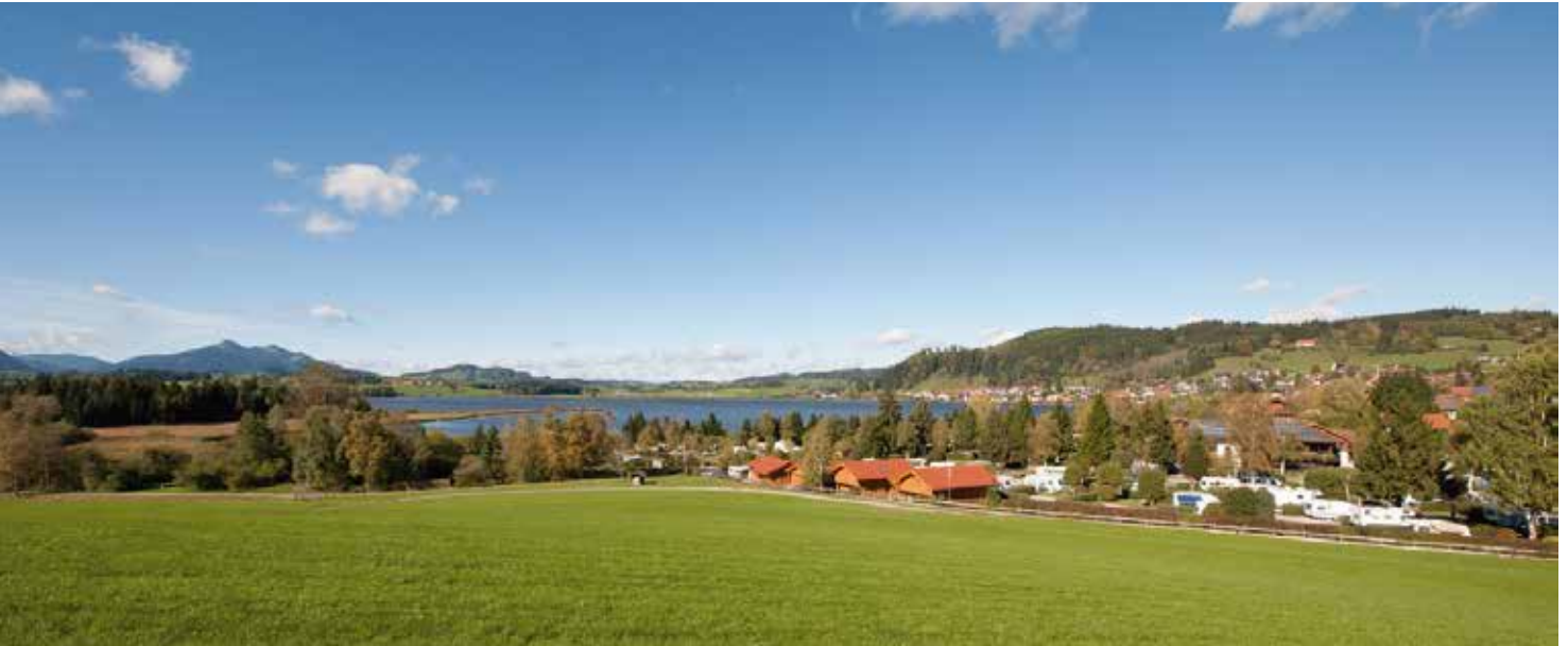
In the summer of 2013, four vacation houses were added to the offerings at Camping Hopfensee (center of photo).