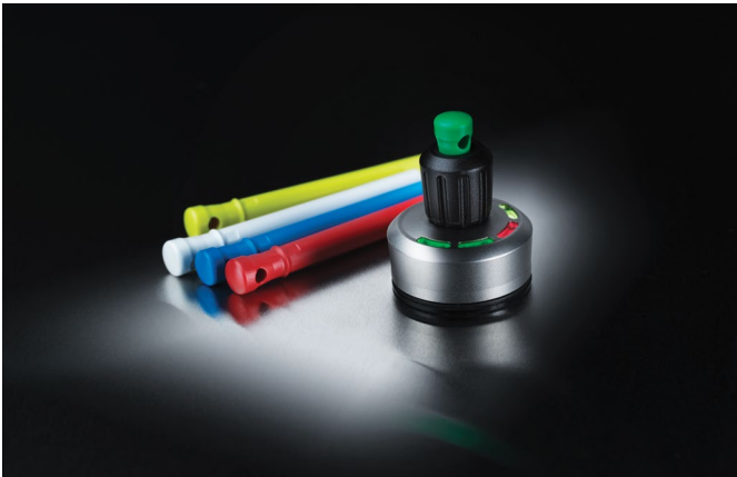
SIRIUS ACT RFID keys

Not only does the technology protect against misuse, it allows for varying levels of equipment access. For example, Operator A, an expert on Machine X, may have a coded key providing a higher level of access on that particular type of equipment, but not on Machine Y, for which he lacks adequate experience. Information is key, literally. Such systems are adaptable per machine, production line and factory location simply by accessing the database. Moreover, the database does not need to reside in the PLC, but rather it could reside in a central server with which the PLC communicates. The result is a much easier access process—one server talking to multiple machines, with the server determining who accesses what.