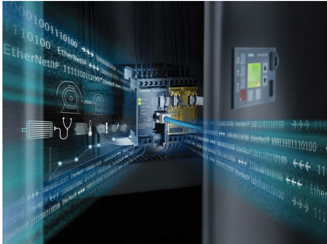
SIMOCODE pro motor management system

A motor that typically runs at five amps is now running at seven amps. If the manufacturer detects that change early on and makes appropriate adjustments before the motor overheats and the process stops, the manufacturer will have treated the root cause, avoiding downtime and lost productivity. Siemens SIMOCODE pro motor management is a good system to provide electrical-based condition monitoring.