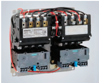
Two-Speed Non-Combination: Class 30 Combination: Class 32