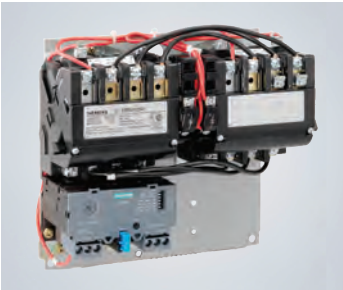
Reversing Non-Combination: Class 22 Combination: Class 25, 26