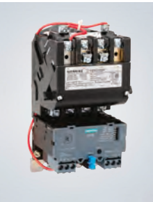
Non-Reversing Non-Combination: Class 14 Combination: Class 17, 18

Half-size starters feature all the rugged performance characteristics of our NEMA rated starter sizes, but are fractionally sized to more closely match your exact motor rating. As a result, significant economic savings are made possible without sacrificing the reliability you expect from a heavy duty starter. Exclusive "half-sizes" save potentially hundreds, even thousands of dollars per project. Every half-size starter saves you money—up to 31% as illustrated in the table. All "half-sizes" comply to applicable UL standards.