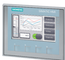
KTP 400 Basic